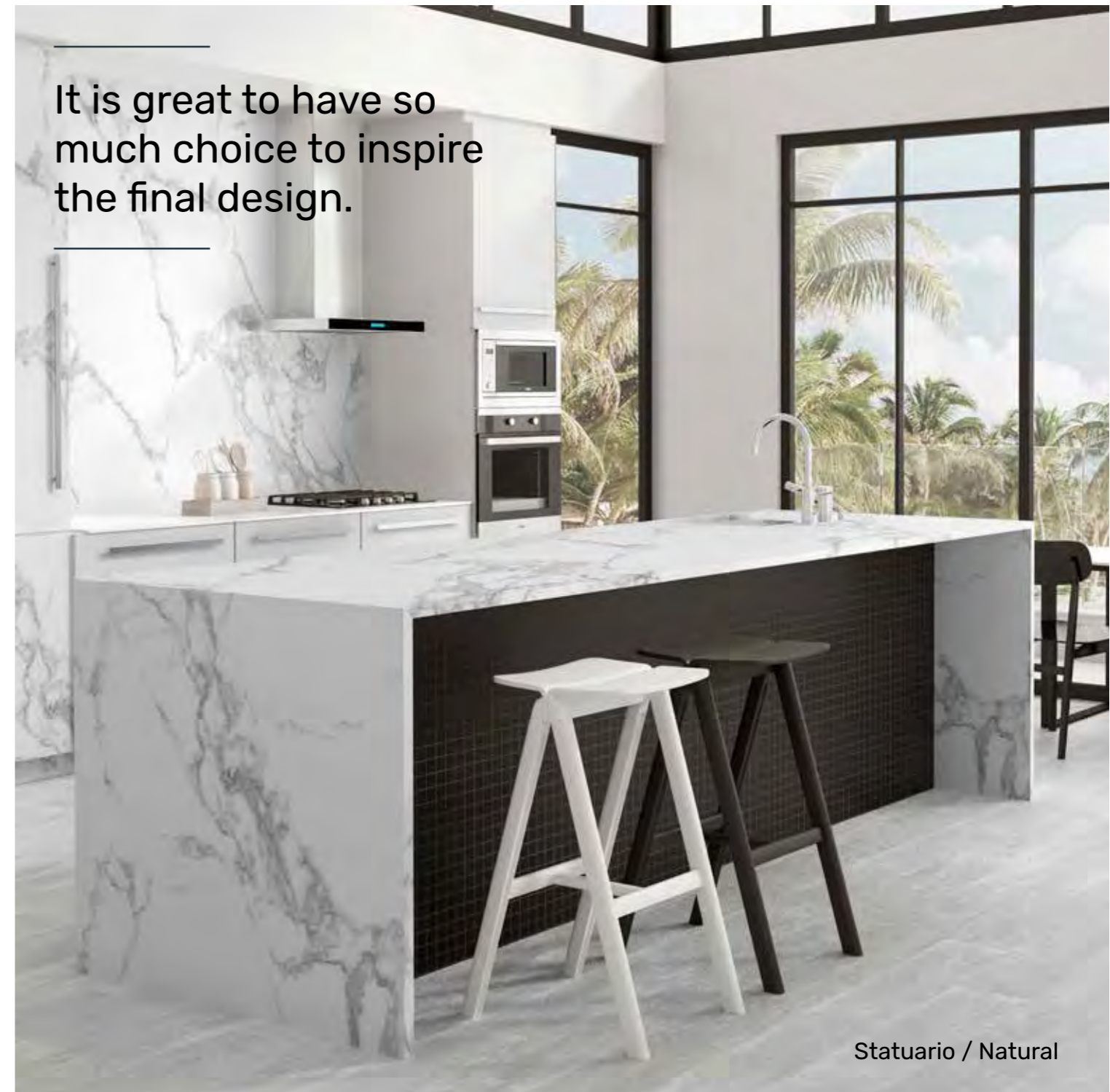
Statuario / Natural

It is great to have so much choice to inspire the final design.